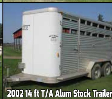
2002 14 ft T/A Alum Stock Trailer