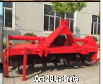
Oct 28 La Crete