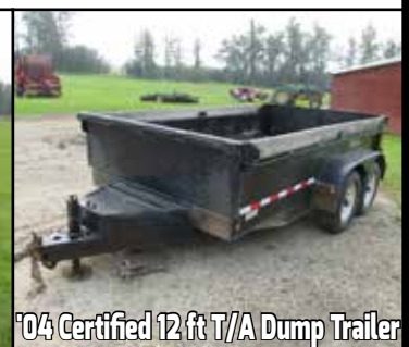
'04 Certified 12 ft T/A Dump Trailer