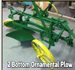
2 Bottom Ornamental Plow