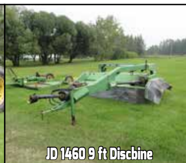
JD 1460 9 ft Discbine