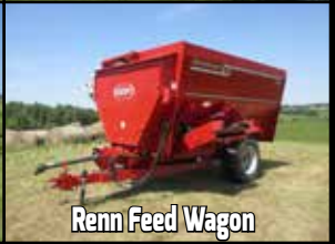
Renn Feed Wagon