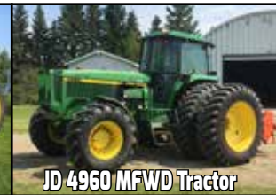
JD 4960 MFWD Tractor