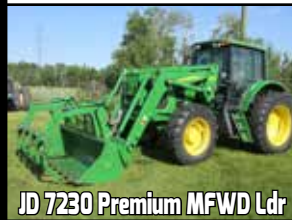
JD 7230 Premium MFWD Ldr