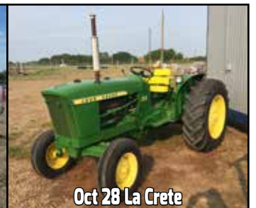
Oct 28 La Crete