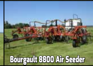
Bourgault 8800 Air Seeder