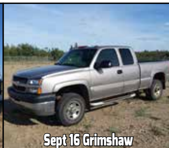
Sept 16 Grimshaw