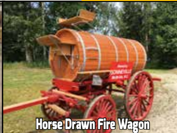
Horse Drawn Fire Wagon