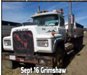
Sept 16 Grimshaw