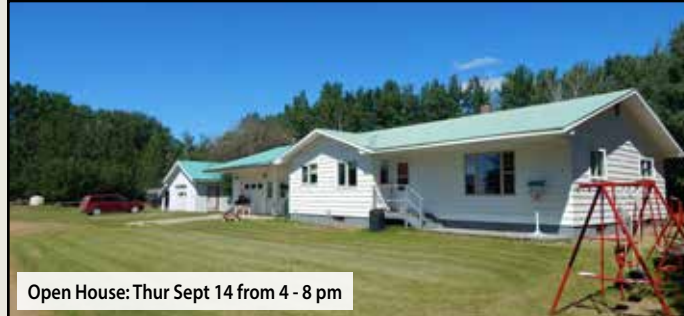
Open House: Thur Sept 14 from 4 - 8 pm

Tractors: (2) Massey Harris 44 • Massey Harris 44 Special 2WD • IH 434 2WD Acreage Tractor • JD 80 2WD Tractor Harvest: McCormick 140 PT Combine Haying: Stooker • 4 Wheel Wagon • Bale Elevator • MF #10 & MF #9 Square Baler Vehicles: 1998 Dodge 2500 4X4 Ext Cab • 2006 Ford Freestar Minivan Trailers: Quad Trailer • Shop Built 22' Tri/A Enclosed Trailer 3 PT, Lawn & Garden: 2 Btm Ornamental Plow • Steel Swing Set • Lawn Cart • Husqvarna Lawn Tractor • ATV Sprayer • 40" Lawn Sweep • 3 Pt 60" Disc • 3 Pt 80" Cultivator • Shop Built Wood Splitter • JD 506 3 Pt 60" Rough Cut Recreational: 1985 Honda 250 Big Red ATV • VERY RARE 1940's Auto Neige Bombardier Wide Gauge Passenger Snowmobile Shop & Tools: Lincoln Welder C75 Welder • Shop Built 46 T Shop Press • Steel Lathe • MISAL 1953 Milling Machine Other: 300 & 500 Gal Tanks • Hit N Miss Engine • Stationary Engines • 300+/- bu Wheat • Cut Dried Split Firewood, OSB Sheathing and Other Lumber • Household • Antiques • Older Equipment & Steel and much more!