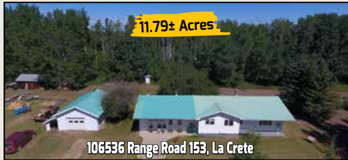
106536 Range Road 153, La Crete