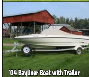
'04 Bayliner Boat with Trailer