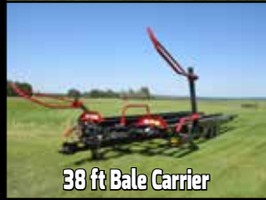
38 ft Bale Carrier