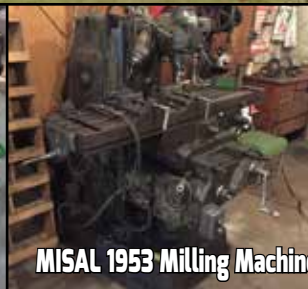
MISAL 1953 Milling Machine