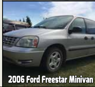
2006 Ford Freestar Minivan