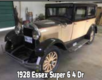
1928 Essex Super 6 4 Dr