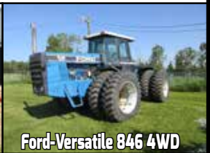
Ford-Versatile 846 4WD