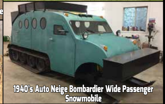
1940's Auto Neige Bombardier Wide Passenger Snowmobile