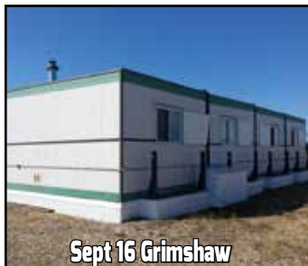
Sept 16 Grimshaw