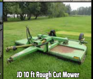
JD 10 ft Rough Cut Mower