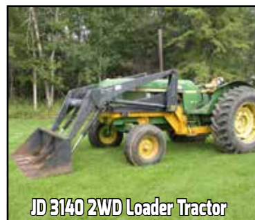
JD 3140 2WD Loader Tractor

Tractors & Attachments: JD 3140 2WD Loader Tractor • Massey Harris 44 Vintage Tractor • Loader Bale Forks Construction / Industrial: 4 ft Excavator Tooth Bucket • Used Excavator Rails & Sprockets Harvest: Scoop-A-Second 6" X 27 ft Grain Auger Haying: JD 1460 9 ft Discbine • JD 1008 Pull Type 10 ft Rough Cut Mower • IH 47 Square Baler • NH 850 Round Baler • JD 660 Side Delivery Rake • Older JD Side Delivery Rake • MF 81 9 ft Haybine • Square Bale Stooker • Older JD 7 Ft Sickle Mower Tillage & Seeding: JD 11 ft Field Disc • Cockshutt 246 10 ft Deep Tillage Cultivator Trailers: 2002 Exiss STK13B 14 ft T/A Aluminum Stock Trailer • 2004 Certified Custom 12 ft T/A Dump Trailer • Shop Built T/A Hoist Trailer • Older 7 ft X 8 ft Snowmobile Trailer 3 PT, Lawn & Garden: Christmas Decoration Trailer Recreational: 2004 Bayliner 175BR Boat with Trailer • 1980 Honda 110 Trail Bike Livestock, Feed & Equipment: NH 516 S/A Manure Spreader • Pull Type Post Pounder • IH 1050 Mix Mill • Totara Grove Alpaca Shearing Table • Alpaca Trimming Chute • Shop Built Double Dog Run Shop & Tools: Canox C-BRD 35 Diesel Welder • Shop Built Log Splitter Household & Antiques: Maytag J2L Wringer Washer • High Steel Wheel Seed Drill Other: Fanning Mill • (2) 5 ft Diamond Harrows