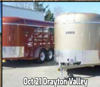
Oct 21 Drayton Valley