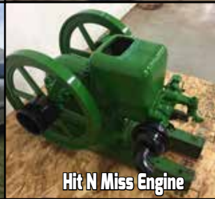
Hit N Miss Engine