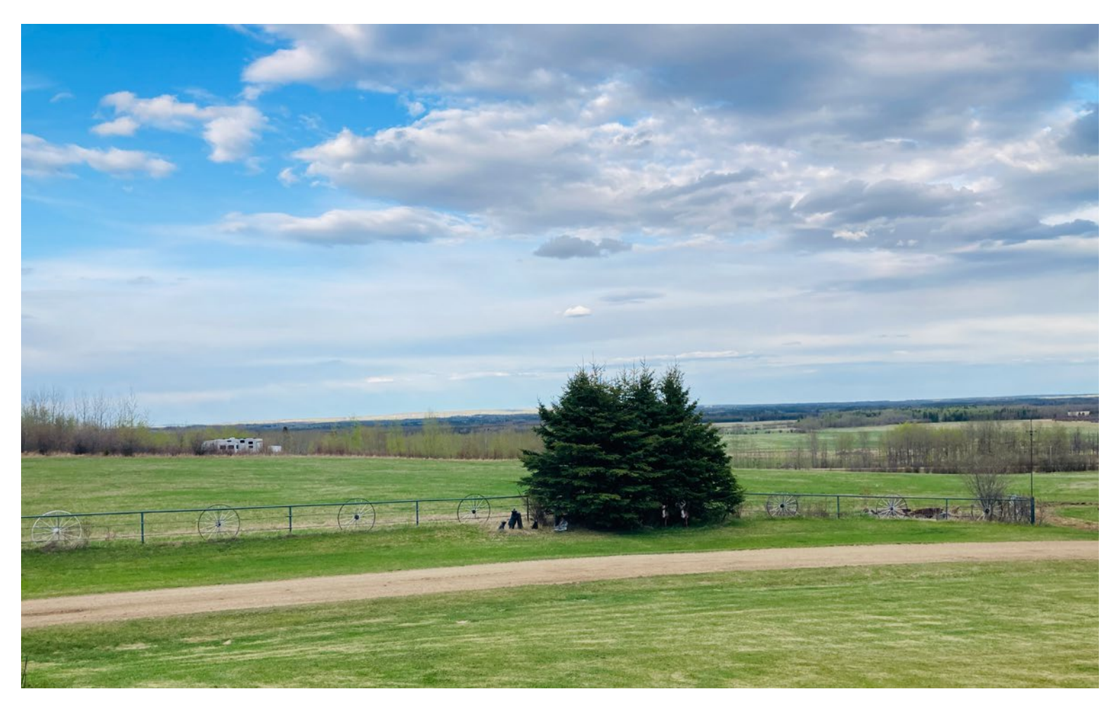
138.18 ± Acres, Home, Shop