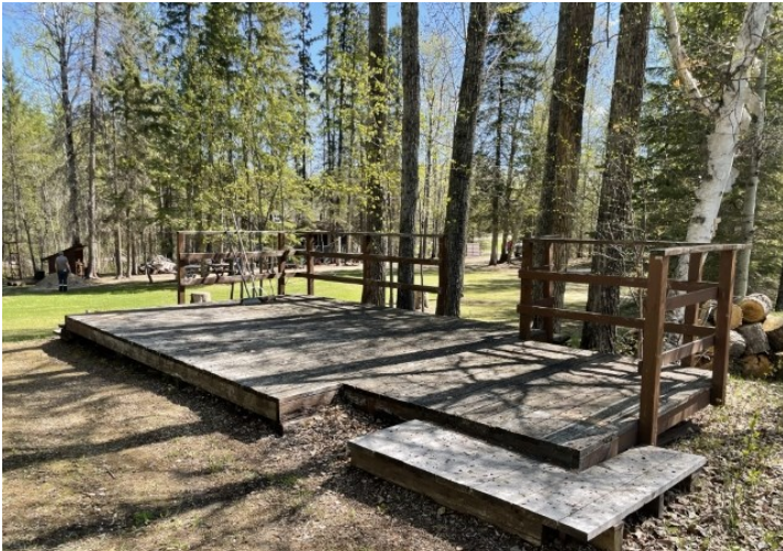
RV spot along south side. It is believed that a portion of this deck encroaches on Lot 86.