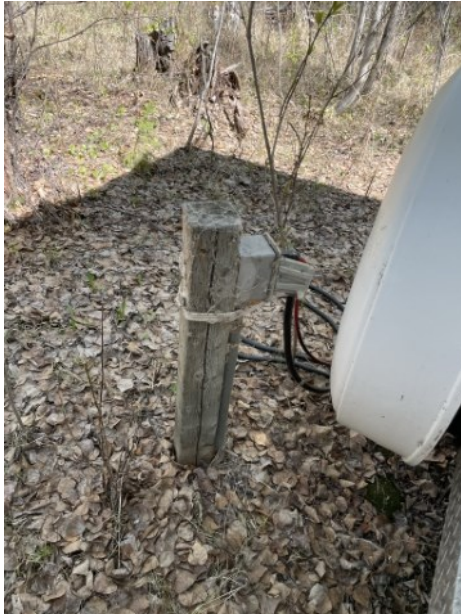
Power post at west end