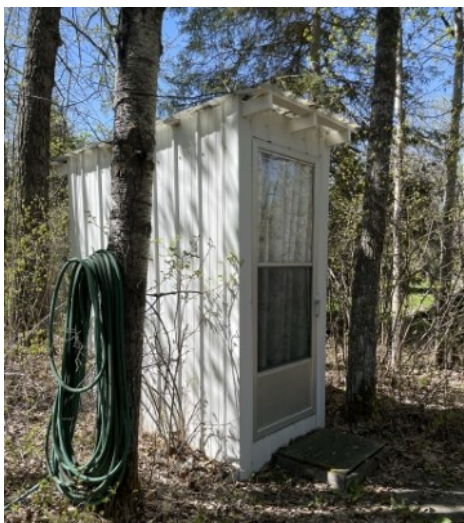
Shower house on this lot (Lot 94) is encroaching onto Lot 86.