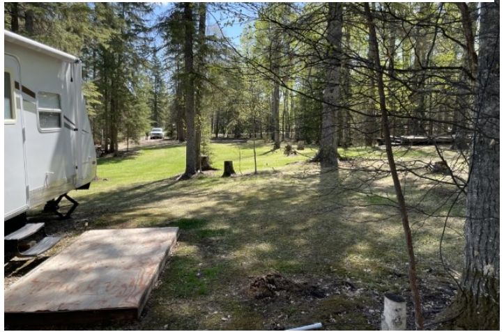
RV spot at west end of lot. This lot has power post.