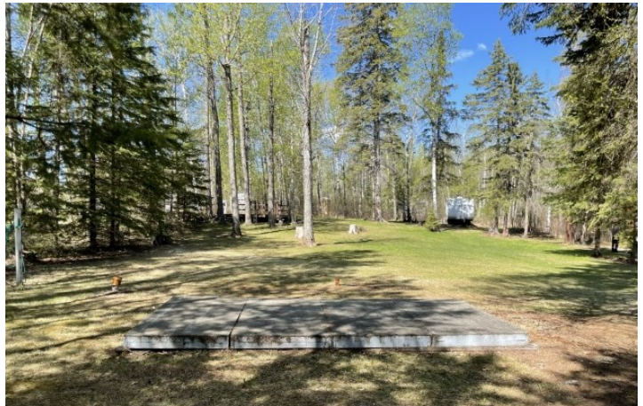
There is 200 gal holding tank, power located by this deck. Water line pedestal is located near.