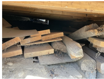
Under the camp kitchen