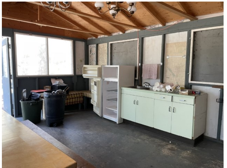
14x20 camp kitchen with wood cookstove, cabinets, fridge, table.