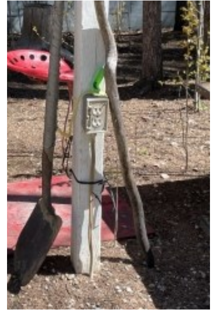
Power post by camp kitchen