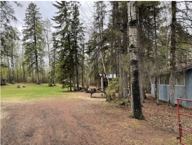
Lot is a short walk to the community boat launch