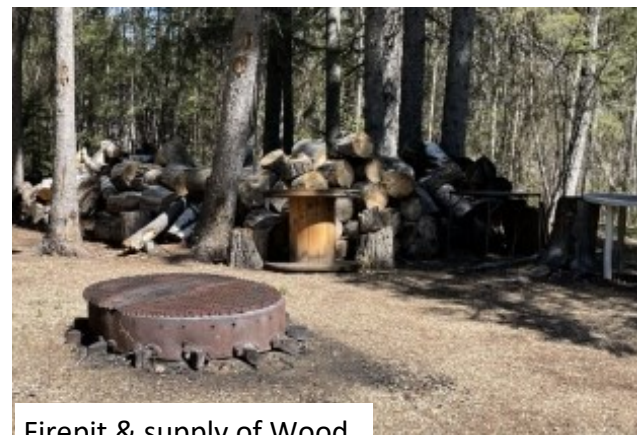
Firepit & supply of Wood