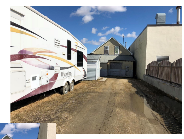
SHED IS NOT Included.